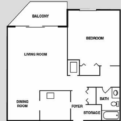
1 Bedroom 1 Bath