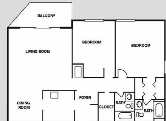
2 Bedroom 2 Bath